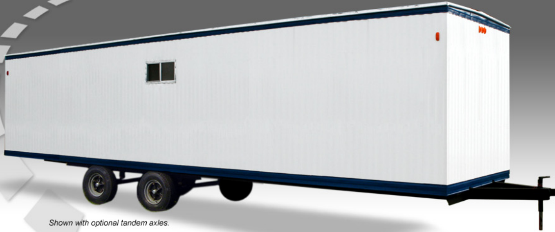
Shown with optional tandem axles.